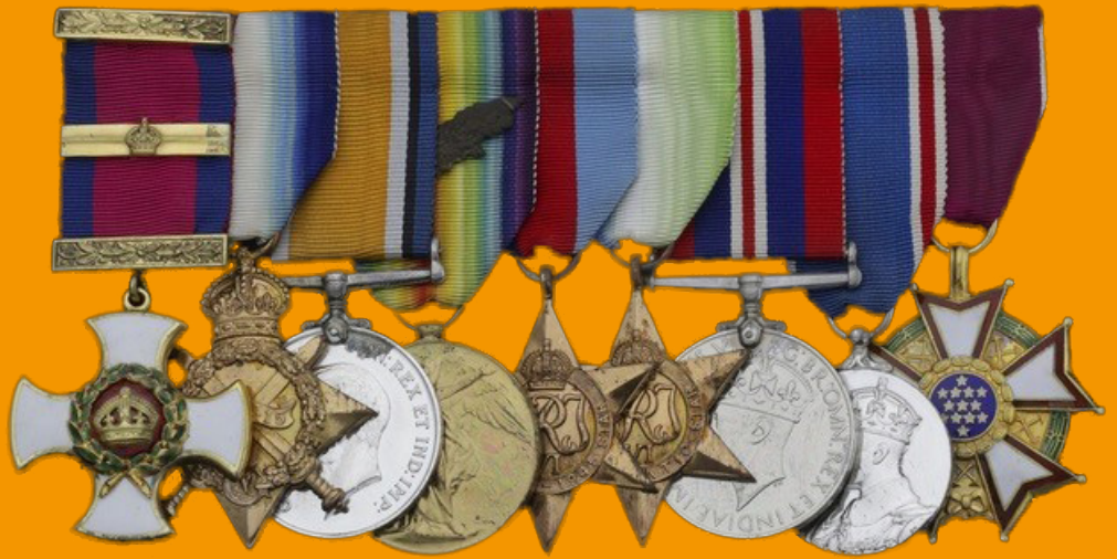
The medals secured by the Friends of the Museum

Captain Cochrane's medals will form part of a new display at the Royal Navy Submarine Museum in Gosport. Visit: https://www.nmrn.org.uk/submarine-museum to find out more.